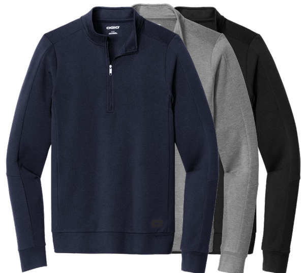
OGIO Luuma 1/2-Zip Fleece OG813 Adult Sizes: XS-4XL | 3 colors