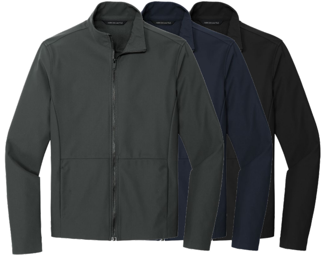
MERCER + METTLE Faillie Soft Shell MM7100 Adult Sizes: XS-4XL | 3 colors