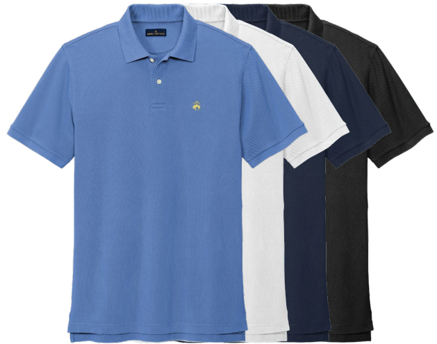
BROOKS BROTHERS Pima Cotton Pique Polo BB18200 Adult Sizes: XS-4XL | 6 colors