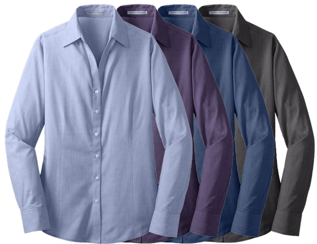
PORT AUTHORITY Ladies Crosshatch Easy Care Shirt L640 Women's Sizes: XS-4XL | 4 colors