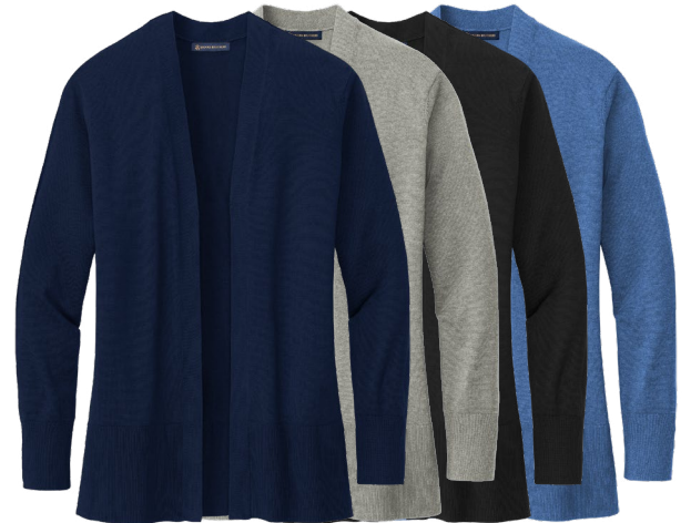
BROOKS BROTHERS Women's Cotton Stretch Long Cardigan Sweater BB18403 Women's Sizes: XS-4XL | 4 colors