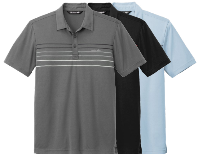
TRAVIS MATHEW Coto Performance Chest Stripe Polo TM1MY400 Adult Sizes: S-3XL | 3 colors