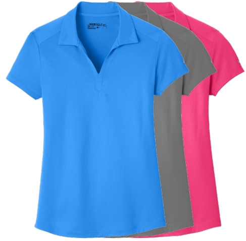
NIKE Ladies Dri-FIT Legacy Polo 838957 Women's Sizes: XS-2XL | 6 colors