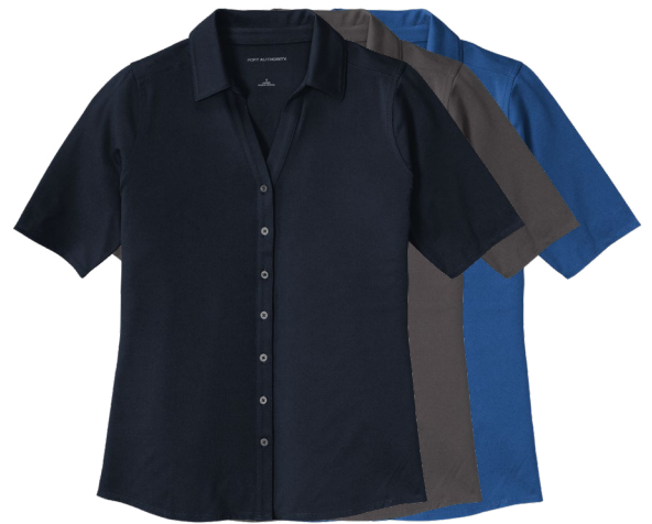
PORT AUTHORITY Ladies City Stretch Top LK682 Women's Sizes: XS-4XL | 5 colors