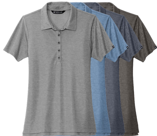
TRAVISMATHEW Ladies Oceanside Heather Polo TM1WW002 Women's Sizes: S-2XL | 6 colors