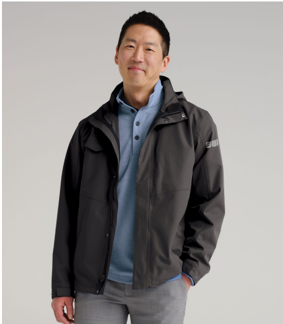
PORT AUTHORITY Collective Outer Shell Jacket J900 Adult Sizes: XS-4XL | 4 colors Worn with NKDC2104, BB18202