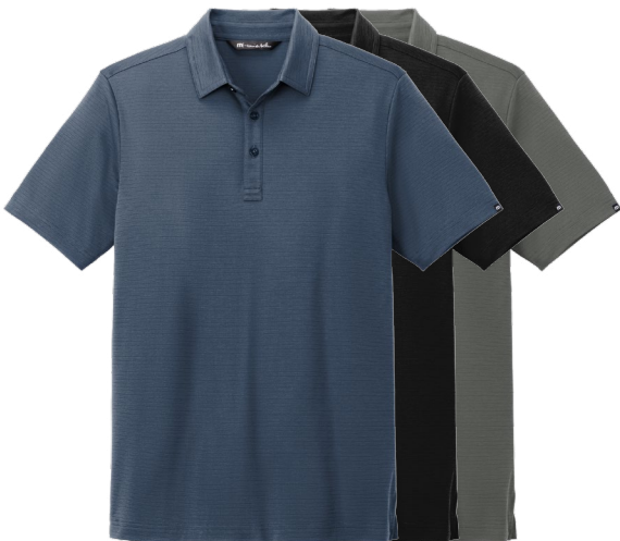
TRAVIS MATHEW Bayfront Solid Polo TM1MY399 Adult Sizes: S-3XL | 4 colors