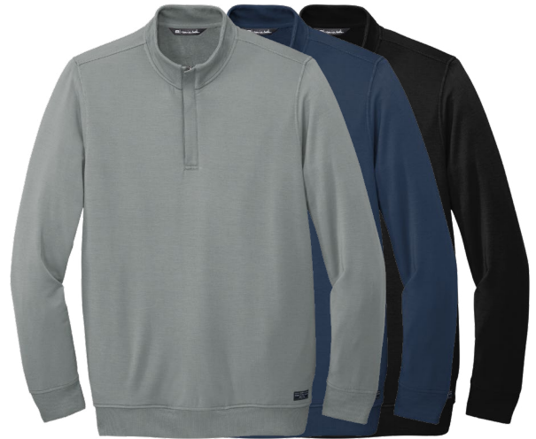
TRAVISMATHEW Newport 1/4-Zip Fleece TM1MU419 Adult Sizes: S-3XL | 3 colors