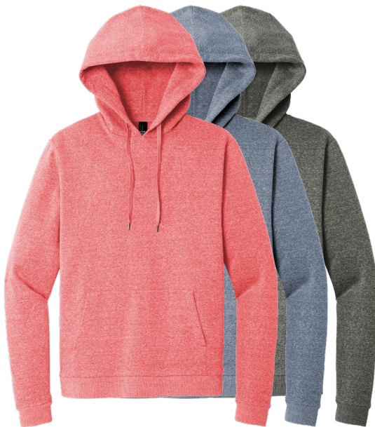
DISTRICT Perfect Tri Fleece Pullover Hoodie DT1300 Adult Sizes: XS-4XL | 12 colors