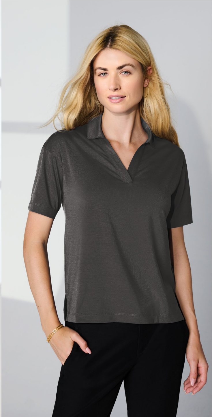
WOMEN'S STRETCH JERSEY POLO