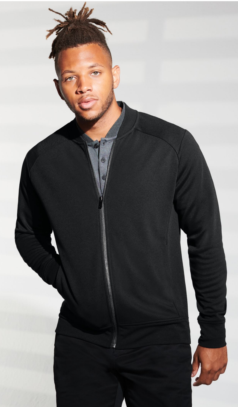
DOUBLE-KNIT BOMBER MM3000