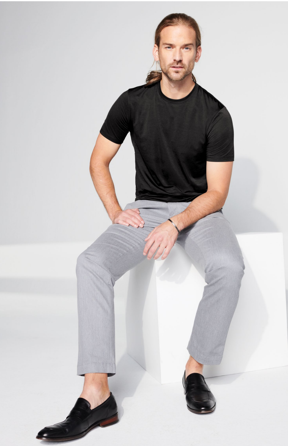
STRETCH JERSEY CREW