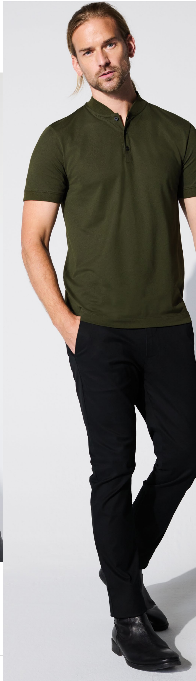
STRETCH PIQUE HENLEY