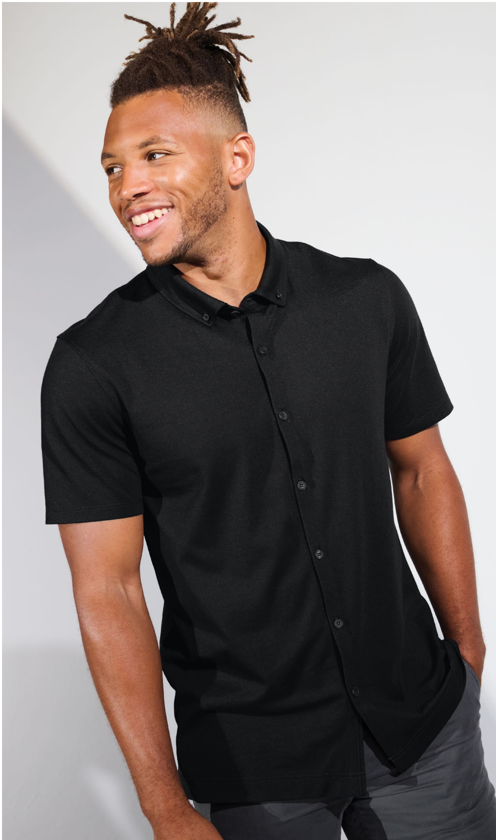
STRETCH PIQUE FULL-BUTTON POLO