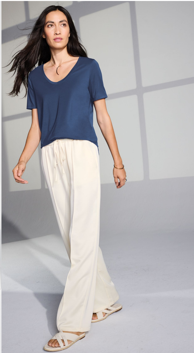
WOMEN'S STRETCH JERSEY RELAXED SCOOP