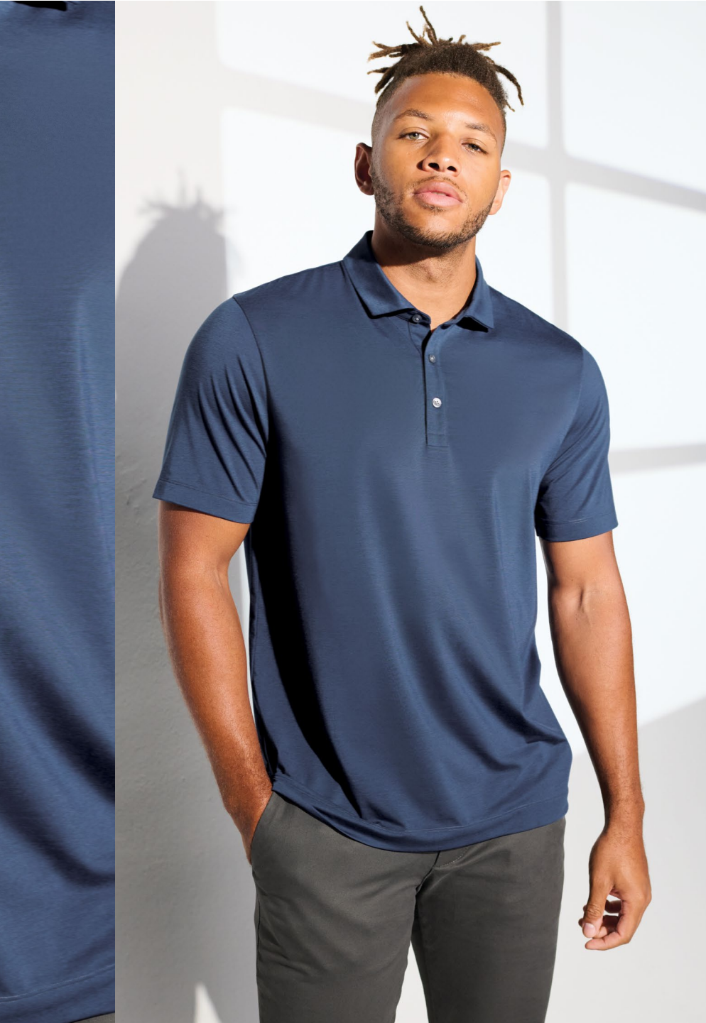
STRETCH JERSEY POLO